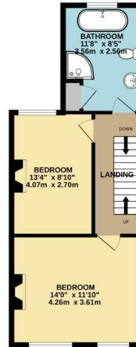
1ST FLOOR 450 sq.ft. (41.8 sq.m.) approx.